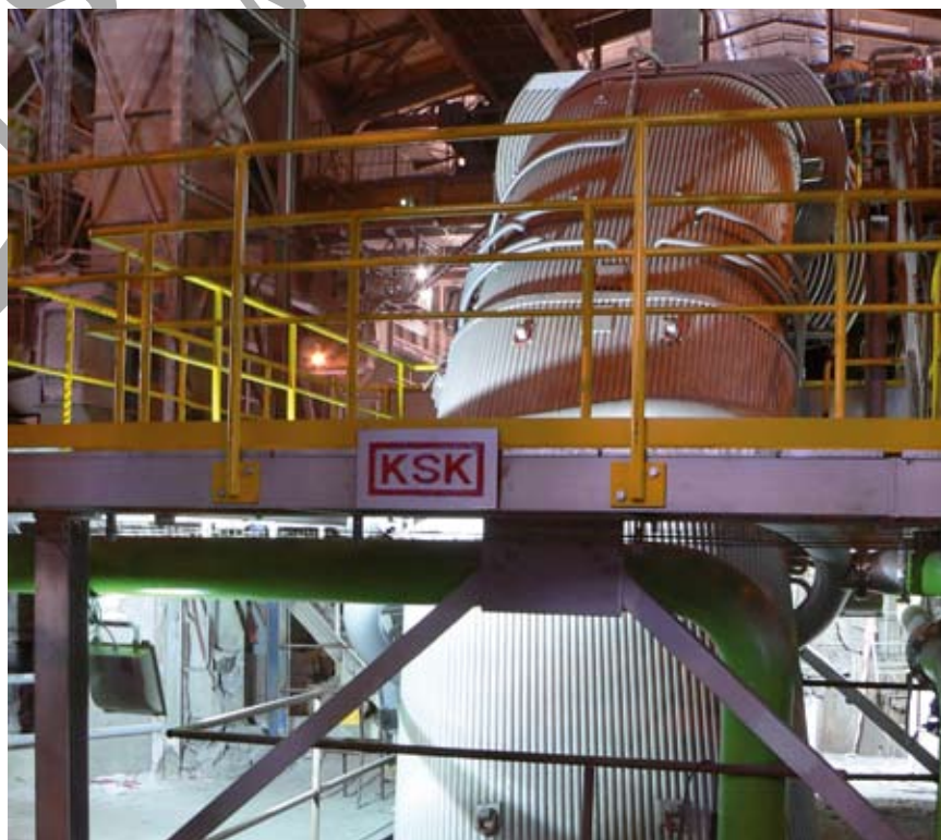
Figure 1. Off-gas bend connected to the EAF

Due to a previously scheduled shutdown during the summer holidays, a time window of only 21 days was available realizing the complete project.