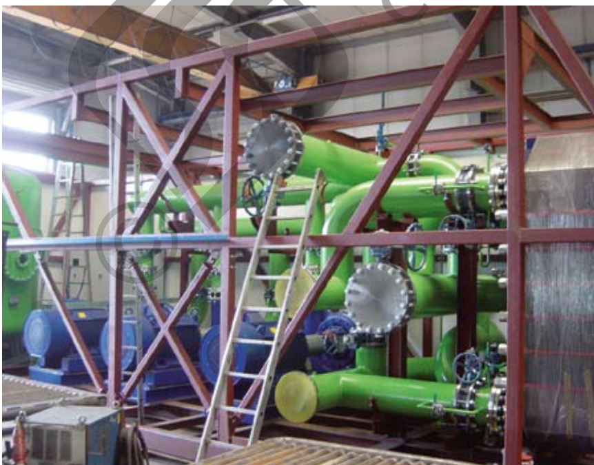
Figure 6. Pump container without roof and side walls