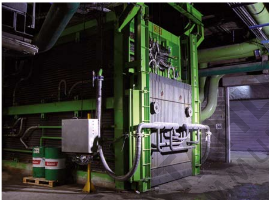
Figure 4. Lifting door at the face side of the combustion chamber

was unable to perform the opening and closing movements as quickly as required. This task was therefore solved by means of a bend consisting of two parts, a fixed segment with an enlarged internal cross section and a separate tiltable “head” (figure 2). The gap is adjusted by two water-hydraulically actuated cylinders. The gap can be adjusted through 25° or over a length of more than 800 mm within the required eight seconds. This thermally highly loaded component can be replaced as a complete unit within a few hours.