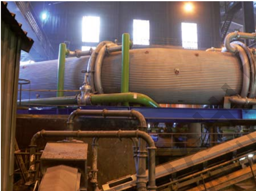
Figure 5. The hot gas duct is made up of five segments

For trouble-free operation of water-cooled components at the EAF and in downstream systems, the flow rate is the most important parameter. Flow rate measurements are the basis for being able to monitor whether the flow rates are as defined. In the event