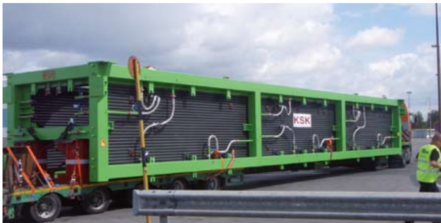
Figure 3. Delivery of the combustion chamber