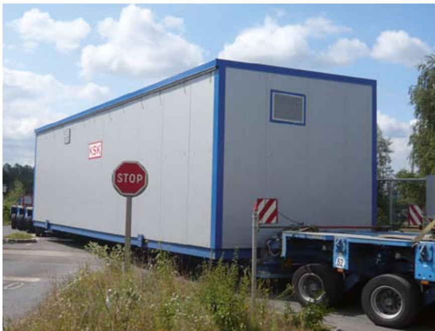
Figure 7. Delivery of the pump container

of a leakage or trouble with a pump it is possible to take action at a very early stage to avoid disruptions in operation. Volumetric flows can be measured with a range of instruments working on different measuring principles. Among the most commonly used methods are magnetic-inductive measurements, probe measurements and ultra-sonic flow rate measurements. In the here described case, the magnetic-inductive method was used.